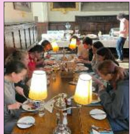
GRAND BREAKFAST: At Wadham College.