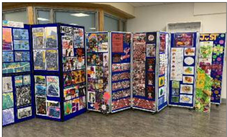
GRAPHICS PROJECTS: A display of Year 13 work in the college main foyer.

Congratulations to those students who are off to study Graphic Communication, Textiles and Illustration at Norwich University next year.