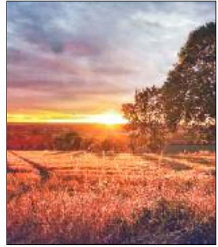
CAMBRIDGESHIRE COUNTRYSIDE: The setting for the Bronze DofE expeditions and (right) Silver sunset in the Chilterns.