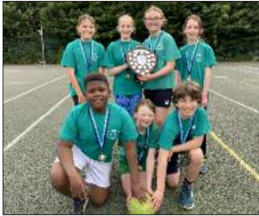
TOP OF THE SHOTS: Coton won the South Cambs netball title.

"The children really enjoy the opportunity to represent their school in inter-school competition and it is nice for them to get the chance to play in the league rounds before experiencing one of the finals nights, which are played in a friendly yet competitive spirit. There is always a nice atmosphere and a real sense of occasion as parents gather to cheer on their children."