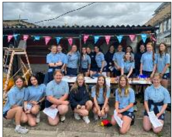
VITAL ROLE: Sports leaders have helped at many events including the swimming gala.