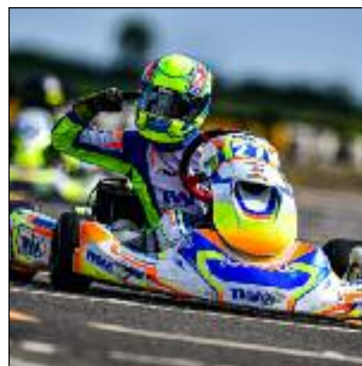
NEED FOR SPEED: To make the podium in the National Champs.

He won the last rounds at Kimbolton and Rissington and leads the Rissington Kart Club Championship with current top five places in every event he has entered this year.