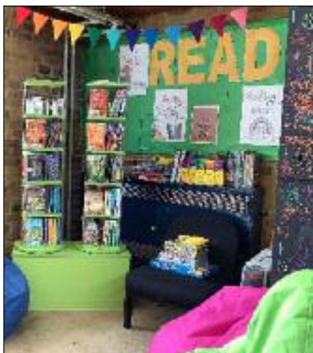
COSY CORNER: The new reading area in KS3 Support.

The school library has had a very busy term!