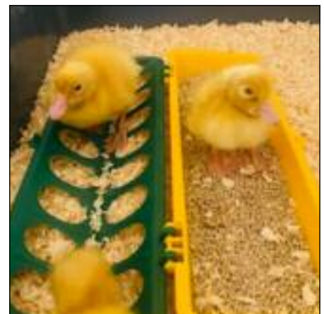
NEW ARRIVALS: Four ducklings hatched in KS3 Support.