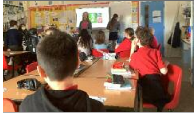
EVERYBODY'S LEARNING: Language leaders practise their skills while teaching primary school pupils.

All the shortlisted students are due to receive a copy of the book after hearing during the Easter holidays that their work had been selected.