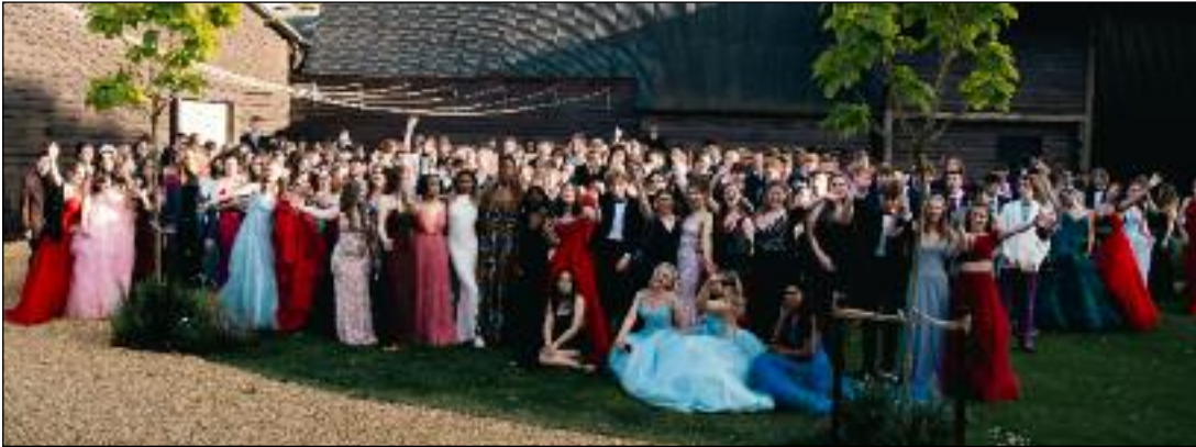
LAST TIME TOGETHER: Year 11 gather for their farewell celebration, the traditional end-of-year Prom.