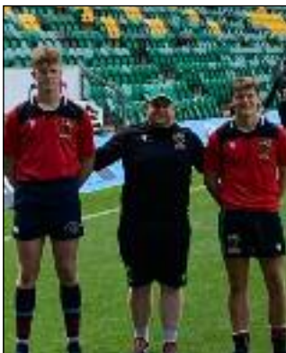
STADIUM EXPERIENCE: For CVC players.