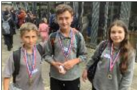
NATIONAL FINALISTS: For the Spanish Spelling Bee.