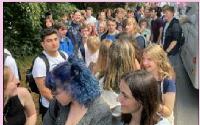
HERE WE GO: Year 12 students went to the University of Nottingham to experience Uni life for a day.