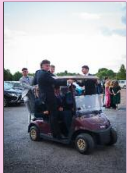
MAKING AN ENTRANCE: By golf buggy.