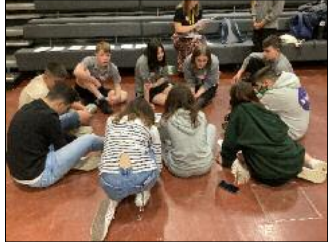
FUN FOR ALL: Spanish students joined Comberton Year 10s for a day of interaction for the first time since the pandemic.