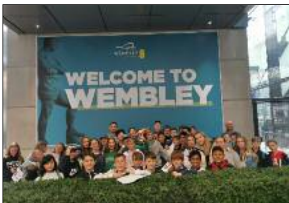
[HOME OF FOOTBALL: Pupils at Wembley for the Women's FA Cup final.