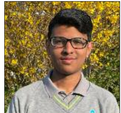
EXCEPTIONAL RESULT: To finish in the top 50 nationally.