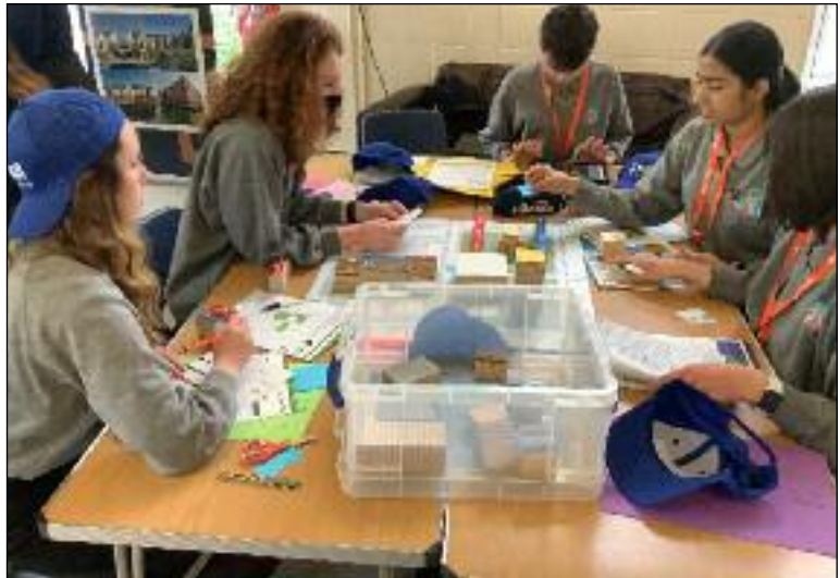
TOWN PLANNERS: Year 10 students work on their construction ideas.

"After we put on our safety gear we were able to go to the roof of the hall, where an expert explained the building process and procedure of the ground source