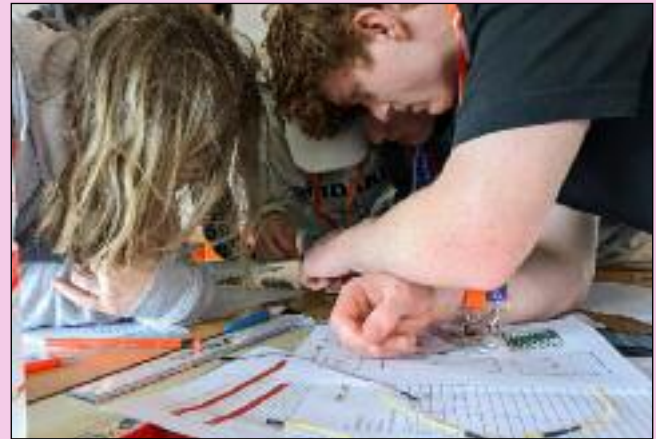
HEADS TOGETHER: Sixth formers worked as a team to complete the tasks at the Cambridge Launchpad experience.