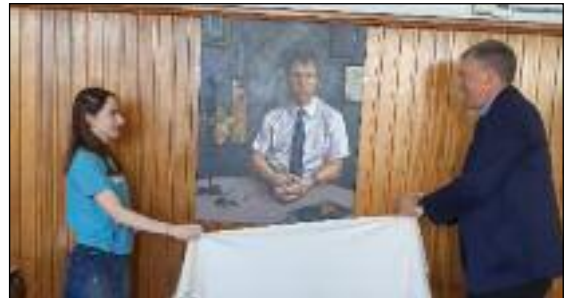
GRAND UNVEILING: Of a portrait that was also exhibited at the Royal Academy's Young Artist Summer Show.