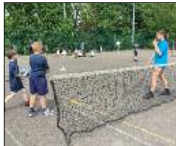
ACTIVITY STATIONS: Pupils rotated to try various games.

Staff commented on how the event had 'made the children feel positive about themselves', 'given them a massive confidence boost' and made them feel 'happy and proud'.