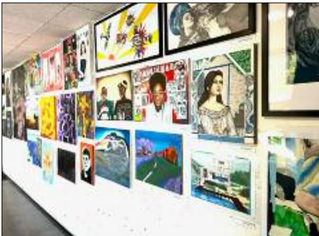
ON DISPLAY: Some of the artwork produced by this year's GCSE students.