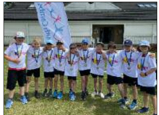
BIG HITTERS: Bourn (left) and Haslingfield won their cricket competitions.