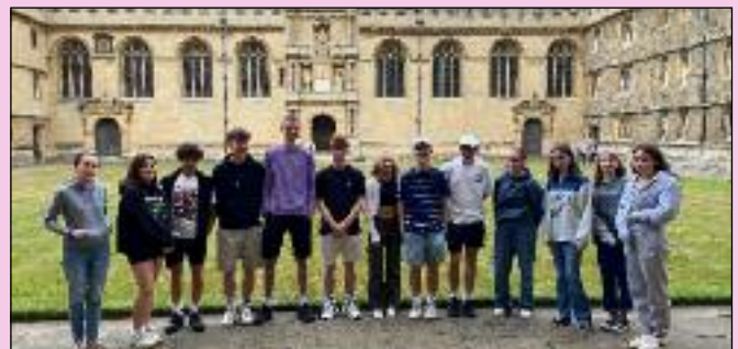
FIRST IMPRESSIONS: Of Wadham College, Oxford