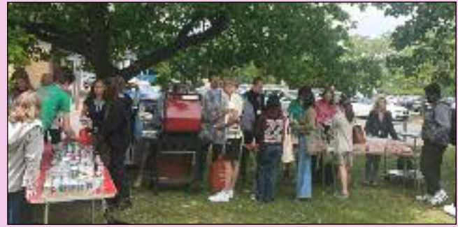
LOOKING AHEAD: Potential students look round at Open Evening (left) and attend a welcome barbecue.