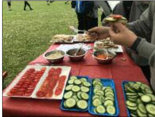
TRY SOMETHING DIFFERENT: Students were encouraged to think about the food choices they make.