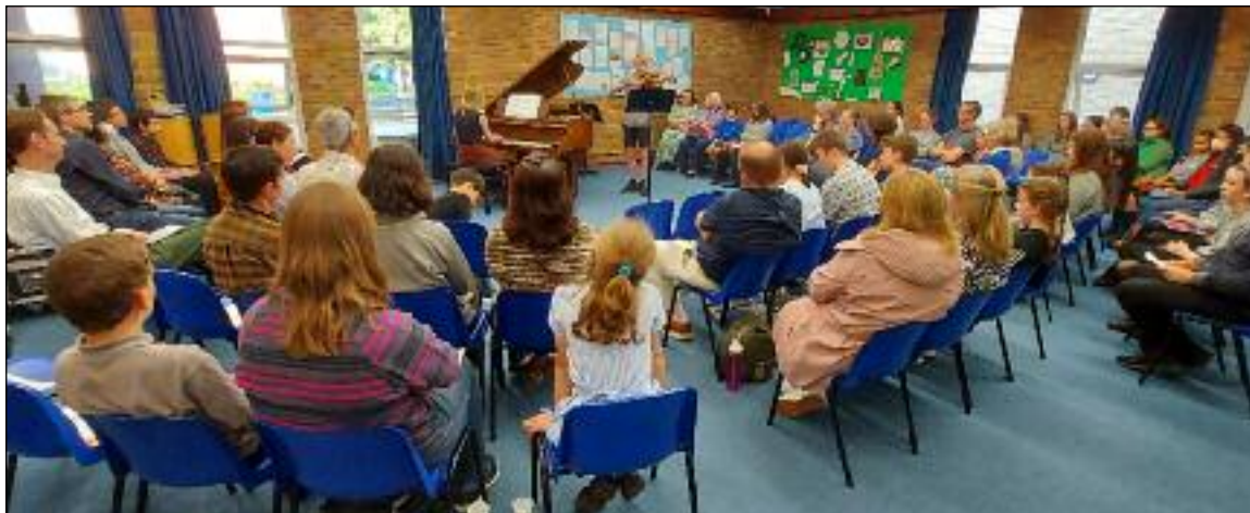
INTIMATE CONCERT: Students performed for family and friends as tutor concerts returned.

"I met new people and really enjoyed the trip."