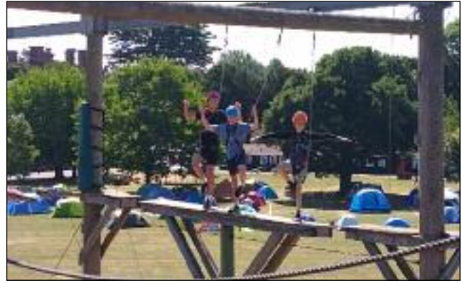
GETTING STUCK IN: Year 7 pupils enjoyed a range of outdoor activities as well as camping in tents.