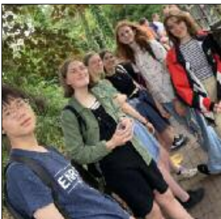
READY TO RIDE: On attractions like Stealth.