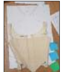
A DAY AT THE MUSEUM: Students combine learning French with art and history.