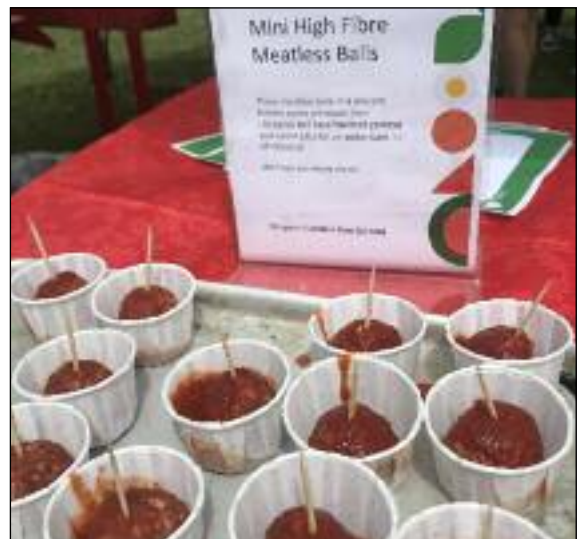
COOKING WITH MEANING: Samples explained not only the ingredients but the benefits.