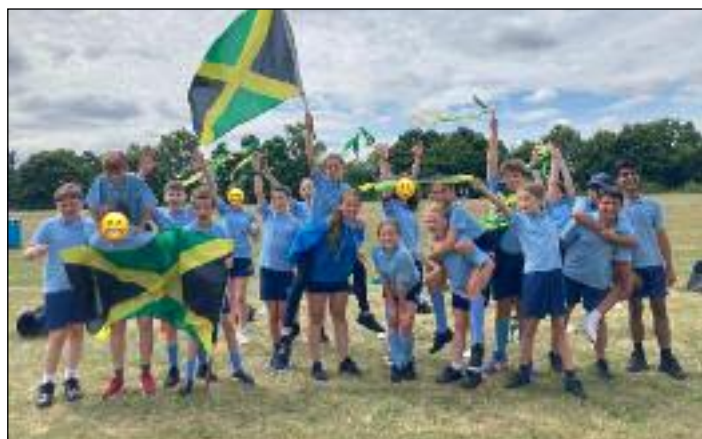
SCENES FROM SPORTS DAYS: Fun, flags and trophies.