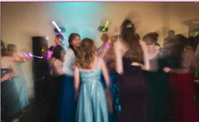
EAT, DRINK AND BE MERRY: Dinner followed by a disco.