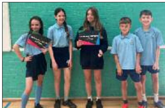
SPORT MATTERS TO MENTAL HEALTH: Year 7 sports reps trained as mental health ambassadors.

We look forward to running similar trips next year.