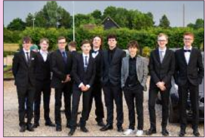
LUCKY LEAVERS: The end-of-year party for Year 13 returned — at the new venue of Cambridge Country Club.