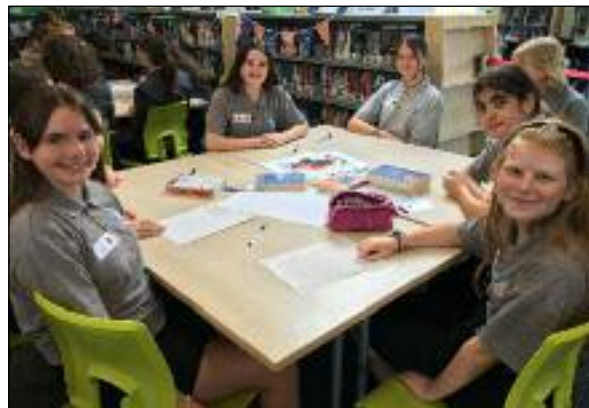
D-DAY: CVC pupils were joined by book enthusiasts from other schools on the day the Carnegie awards were announced.