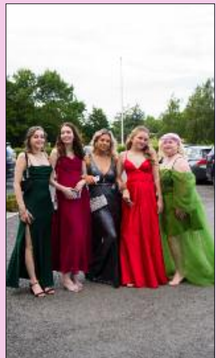
GLAD RAGS ON: For the Year 13 party.