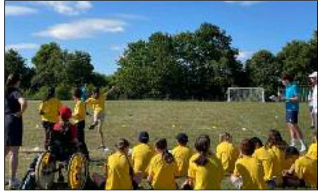
AND THEY'RE OFF: The first Year 6 festival for three years is under way.