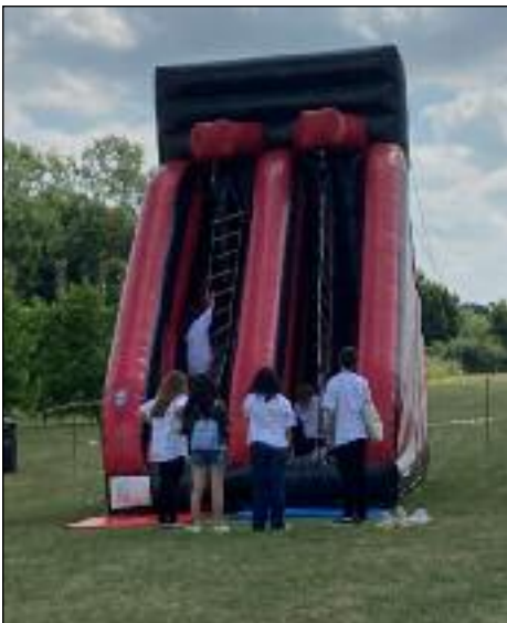
FUN AND FOOD: Inflatables and ice cream formed part of the entertainment on Celebration Day at the end of the exam period.