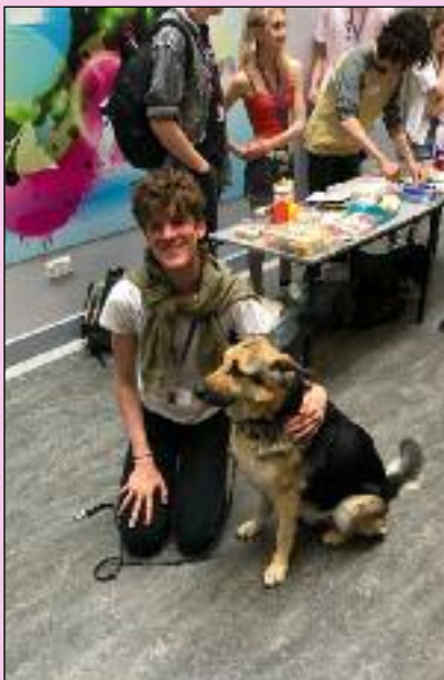
SPECIAL GUEST: Retired Hero was the star attraction at the Sixth Form fund-raiser for Guide Dogs UK.